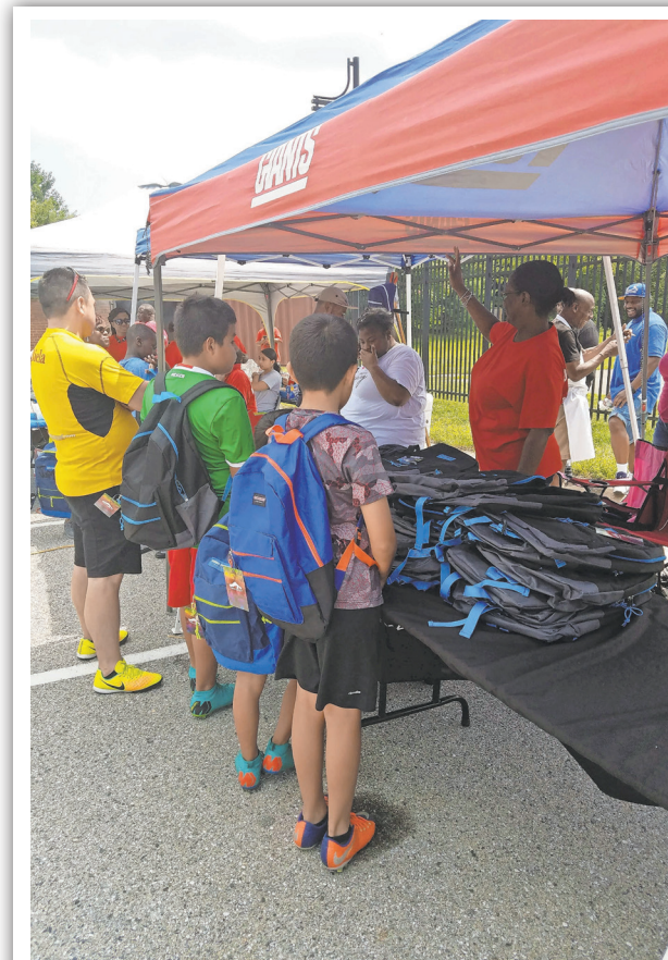
Attendees receive free backpacks at a Back to School Backpack Giveaway presented by Moon's Barbershop.

"I'm blessed and overwhelmed to be able to provide this opportunity to those in need. This provides a sense of purpose, and it also creates a stronger