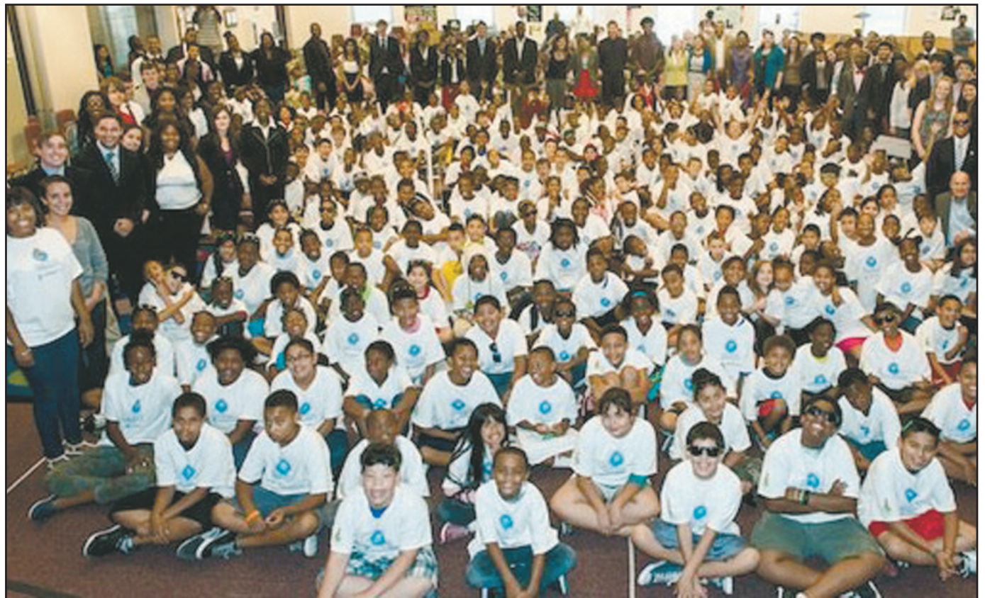
The National Society of Black Engineers, one of the largest student-governed organizations in America, wants to boost the number of engineering degrees granted to black students to 10,000 annually by 2025. (Above) Students at a Summer Engineering Experience for Kids (SEEK) program event earlier this year. SEEK is the nation's largest summer engineering program geared towards African American pre-college students. SEEK was held at 17 different locations in 16 cities across the United States in July and August 2015.