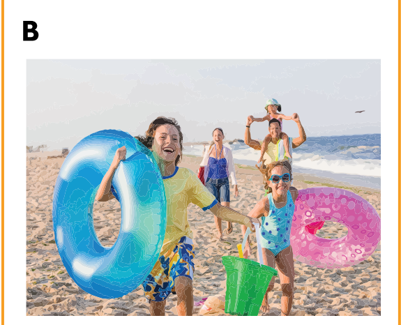
Answers: 1. Birds in sky 2. Polka dots on girl's swimsuit 3. Missing items in background 4. Woman has straps on swimsuit

Don't let the stairs limit your mobility! Discover the ideal solution for anyone who struggles on the stairs, is concerned about a fall or wants to regain access to their entire home. Call AmeriGlide today! 1-844-317-5246 (*236966) How many tickles does it take to make an octopus laugh? Tentacles.♥♥! I was taken to the hospital for a PEEKABOO Accident. They put me in the ICU!