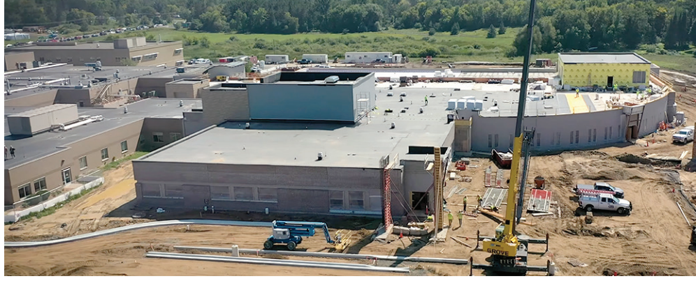
Aerial view of Riverwood Healthcare Center new surgical center during construction.

By ANN SCHWARTZ Following several years of construction, about 800 folks from the Aitkin area helped celebrate the opening of the new surgical center at Riverwood Healthcare Center in Aitkin. A grand opening was held on August 12.