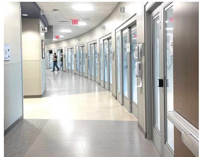
The new wing boast expanded recovery areas.

Outside, it was a celebratory day indeed with music, food, speeches and more, with the August sun and blue sky happy to shine down on all. Retired doctors and new surgeons were spotted among the crowd, with couples treating it like a date night and plenty of cameras on hand to record the event. The line was about a block long with commu-