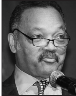
Jesse Jackson Sr.

Senator Bernie Sanders, the Democratic candidate for president, shocked people when he noted that 51 percent of African-Americans aged 17 through 20 who have graduated high school or dropped out of high school are unemployed.