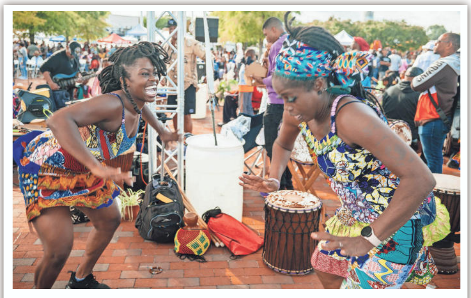
Ni Dembaya African Drum & Dance Ensemble dancers on the Main Stage at a previous Kunta Kinte Heritage Festival entertain festival goers. This year marks the 34th year of the annual celebration. It will be held at the Navy-Marine Corps Memorial Stadium (Blue Lot), on Saturday, September 14, 2024 from 10 a.m. – 7 p.m. in Annapolis, Maryland.

According to KKHF's Facebook account, after Kunta Kinte's capture