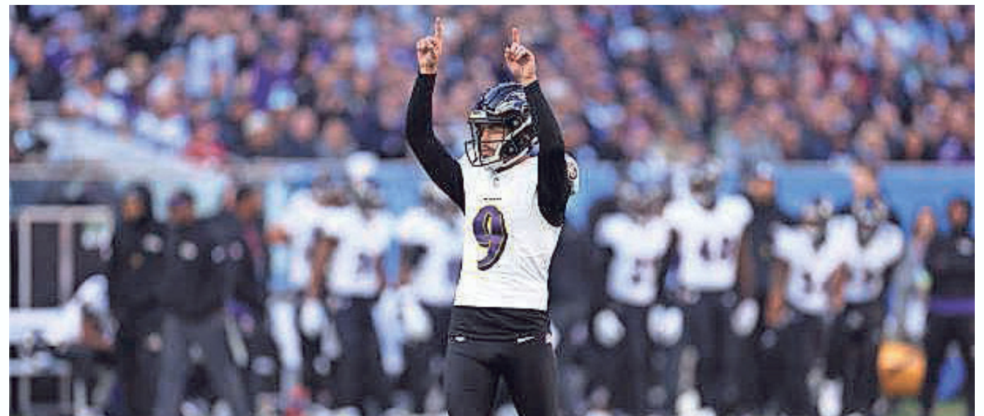
Justin Tucker

"I think everybody in here would say the real accountability is taking the burden of blame on yourself so somebody else doesn't have to. And everybody else in this locker room is built just like that. I think we're going to be just fine. We're going to be a really good football team."