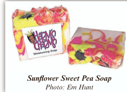
Sunflower Sweet Pea Soap