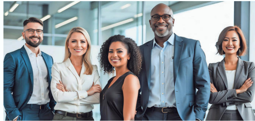
A smiling team of diverse businesspeople standing together in an office.

Fake Job Offer Scam: This scam begins with an unsolicited text message offering a job opportunity with an attractive salary and benefits. The scammer poses as a recruiter or employer, claiming to have found your resume online or through a mutual connection. To secure the job, victims are asked to pay upfront fees for training, background checks, or equipment. Once payment is made, the “employer” disappears, leaving them out of pocket.