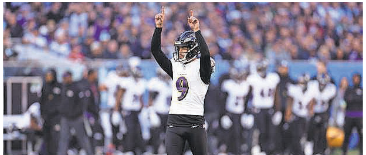
Justin Tucker

"I think everybody in here would say the real accountability is taking the burden of blame on yourself so somebody else doesn't have to. And everybody else in this locker room is built just like that. I think we're going to be just fine. We're going to be a really good football team."