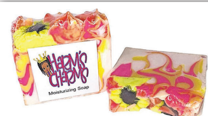
Sunflower Sweet Pea Soap