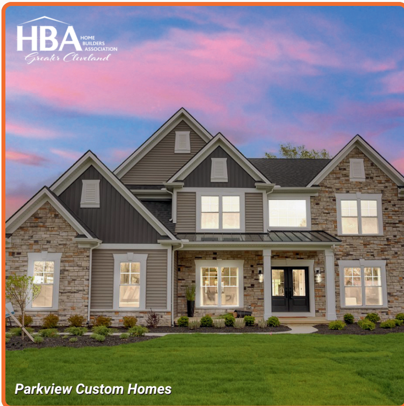
Parkview Custom Homes

Find more easy home improvement tips and ideas at eLivingtoday.com .