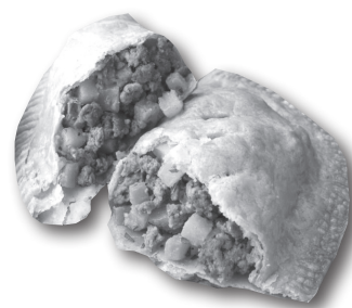
Gravy is available (12 oz.) for

The pasties sell for $8 each and are made following a recipe for the pastry-enfolded meat and vegetable treat that dates back to the days when iron miners on the Cuyuna Range and tin miners in England took them to work in the mines. Each pasty is large enough to serve as a full meal for one or two people.