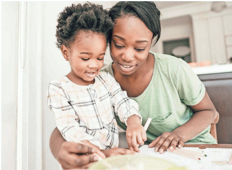
Parent Learning With Child