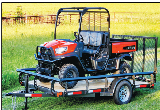
Trailer Built By Como-Pickton FFA

BUY YOUR RAFFLE TICKETS TO WIN THIS Kubota RTV X w/Trailer