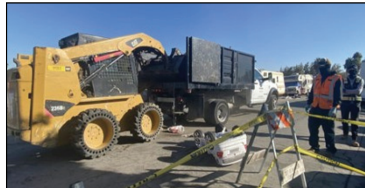
The city began sweeping a homeless encampment near Columbus Park in early September. The area was cleared two years ago to comply with the Federal Aviation Administration's demands, and since then has repopulated with dozens of people living in their cars and RVs.

San Jose wants to open eight safe sleeping sites throughout the city, with each tent having a max-