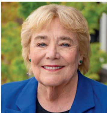
Zoe Lofgren U.S Congresswoman, District 18