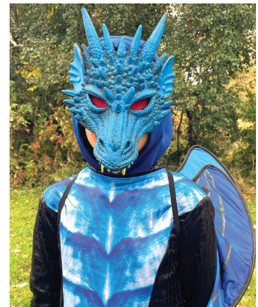
A fierce dragon hosts a Pumpkin Patch game, as little ones tested their competitive spirit and creativity. Families also savored delicious food and baked goods available for purchase, adding a tasty touch to the day's activities.