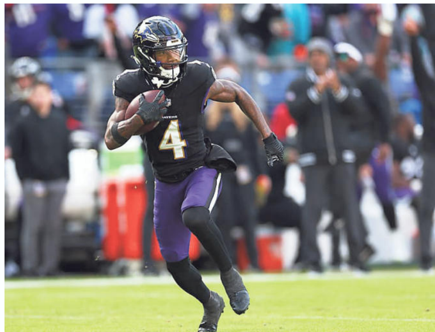
Zay Flowers

"Zay Flowers is exactly the weapon we absolutely knew was and would be and has been, to be honest with you. He's been there all along," Harbaugh said.