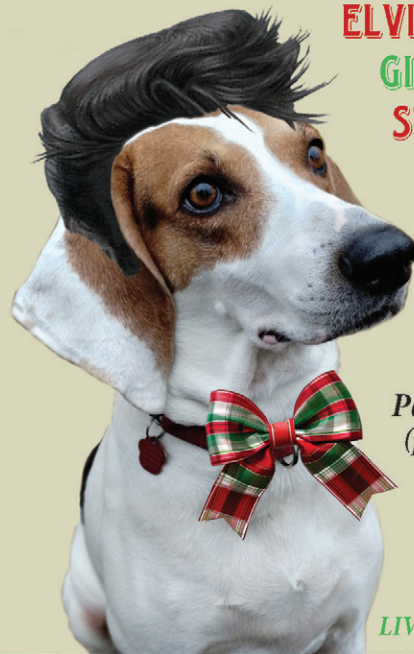
Pets Welcome! (please use stairs)