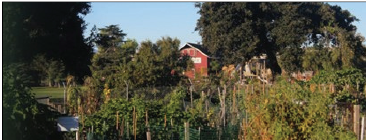
The 44-acre Emma Prusch Farm Park in East San Jose. The garden is maintained by the Prusch Farm Park Foundation.