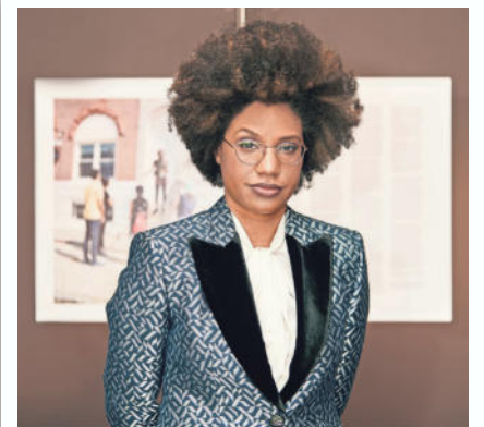
LaToya Ruby Frazier is an award-winning author and artist whose art installation "More Than Conquerors: A Monument for Community Health Workers of Baltimore, Maryland 2021-2022" will be on display at the Baltimore Museum of Art until March 2025.

through visually [regarding] class, representing peoples' rights, human rights, workers' rights. My work is very much about civic engagement, it is about American democracy, it is about empowering people and meeting them exactly where they are," she said.