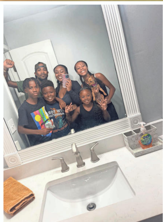
Shaleece Williams