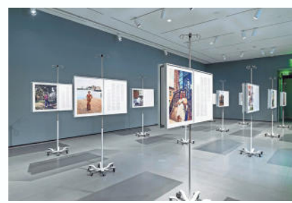
"More Than Conquerors: A Monument for Community Health Workers of Baltimore, Maryland 2021-2022" features a series of portraits and related narratives mounted on 18 socially distanced, stainless-steel IV poles that celebrate community health workers in Baltimore during the rollout of the COVID-19 vaccine.