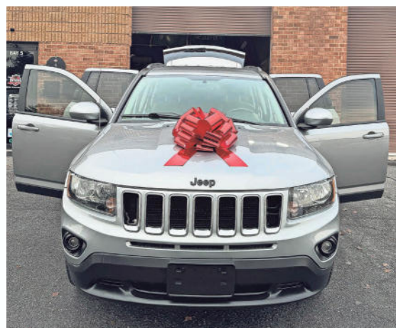
Cars With Care Giveaway Vehicle from 2023. Entries are now being accepted for this year's car giveaway.