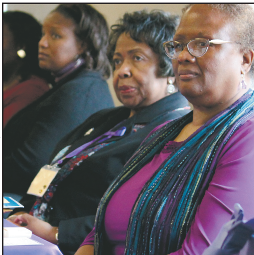
Participants at last year's the Pythias A. and Virginia I. Jones African-American Community Forum on Memory Loss hosted by Alzheimer's Association Greater Maryland Chapter.