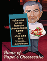
Home of Papa's Cheesecake