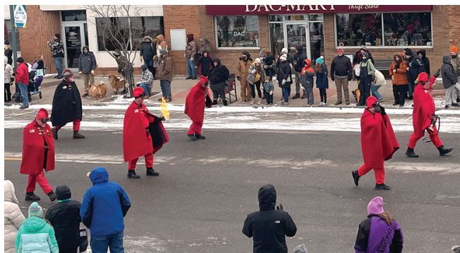
The Vulcans, from the St. Paul Winter Carnival, were the grand marshals of the parade.

Traditional events included visits with Santa and his elf, a craft fair and merchant deals. Also featured were a footrace, vintage snowmobile display, bonfire, Sip N Strole, Ice Hole Hop, Beer Poke, bake sale,