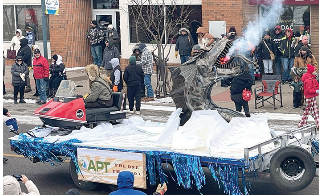
American Peat Technology's float featured a fire-breathing dragon in the Fishhouse Parade.