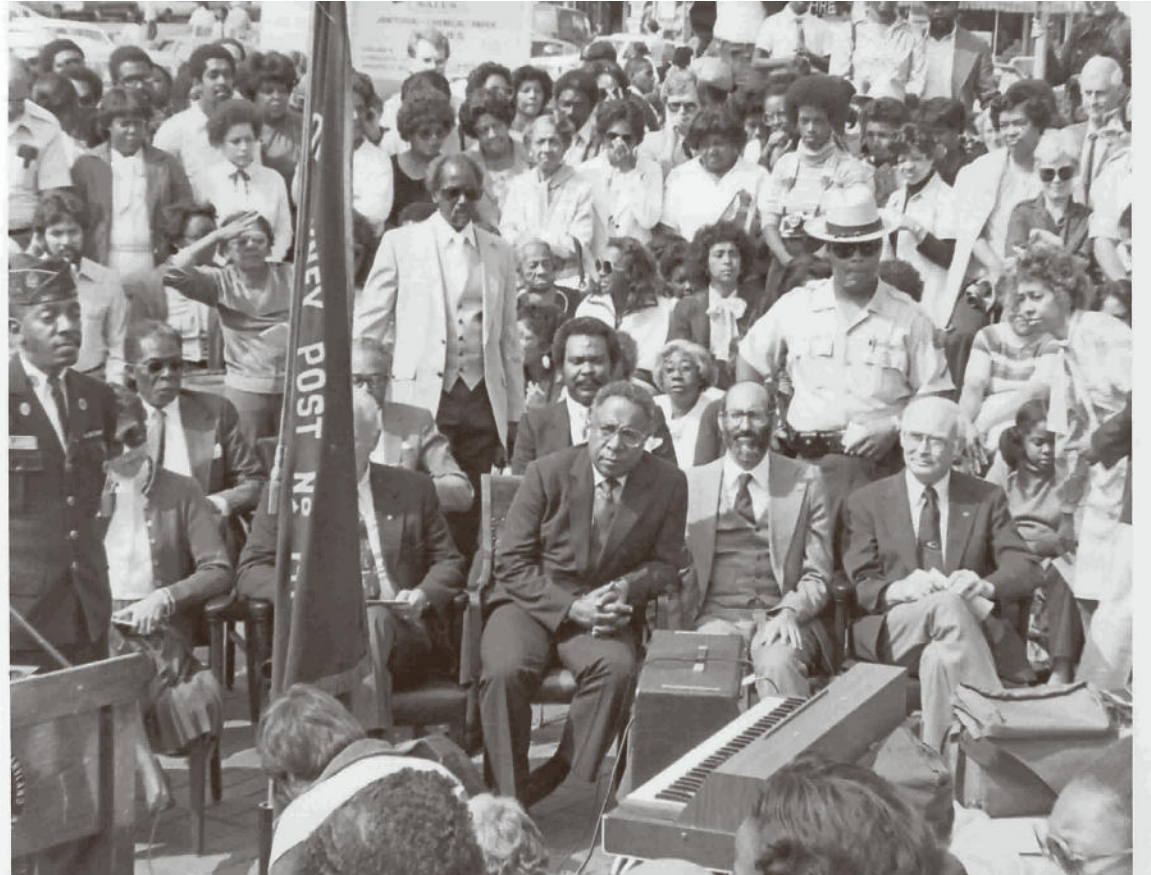
Alex Haley attends a huge gathering at the dedication of the Kunta Kinte plaque at the Annapolis City Dock in 1981.

Visit https://kintehaley.org/conferences/25-year-anniversary-celebration to learn more about the forthcoming celebration that is free and open to the public.