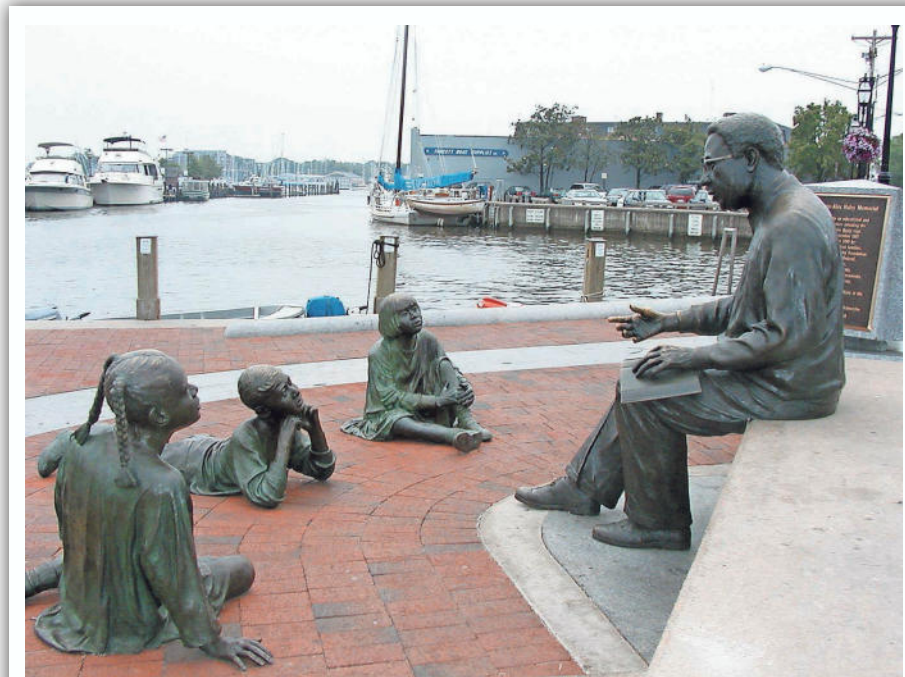
The Kunta Kinte-Alex Haley Memorial at the Annapolis City Dock depicts author Alex Haley reading a story to three children of different ethnicities.