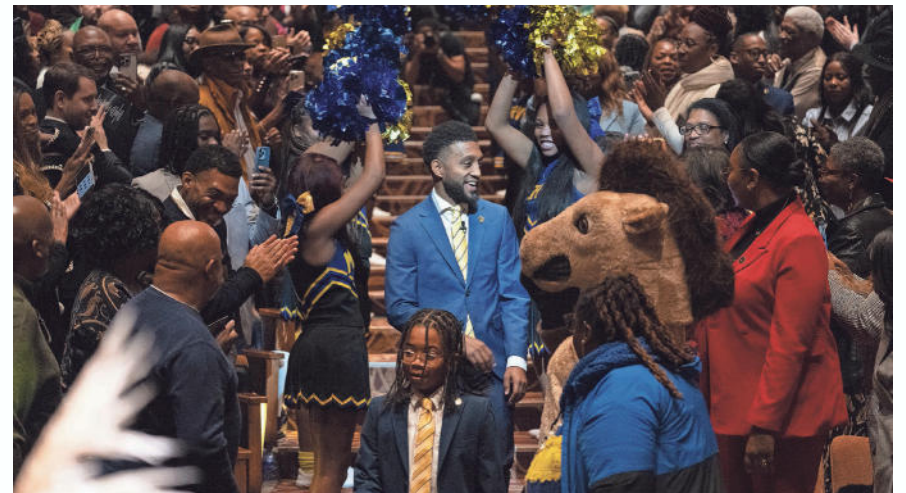
Mervo's cheer team, along with a massive crowd of supporters, welcomes Brandon Scott to the mayoral inauguration ceremony on December 3, 2024. The event was held in Morgan State University's Murphy Fine Arts Center.

During his inaugural address, Scott touted the successes of his first term and highlighted some of the challenges. His violence reduction strategy and the