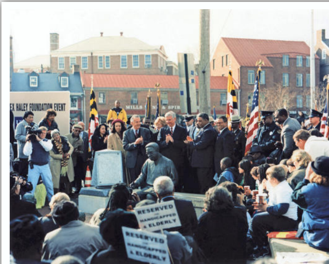
Haley family members, political figures, and memorial organizers gather around the Alex Haley Memorial at its unveiling on December 9, 1999.

to obtain approvals, raise funds, create the Memorial design, and identify and select the artisans, to make the Memorial a true reality.