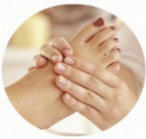
Deep Foot massage

Thanksgiving Christmas $5 Discount for any item