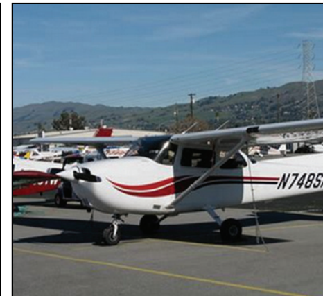
The offer ensures that every piston-powered plane can refuel with unleaded aviation gas.

"Offering G100UL to our airport users has been years in the making," Peterson said. "This fueling alternative positions RHV as the first airport in the nation to offer unleaded aviation fuel for the entire general aviation community and we are pretty excited