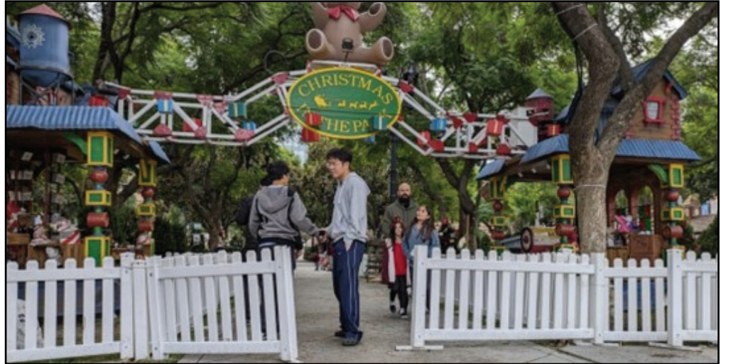
Christmas in the Park needs to fill a $100,000 gap to avoid pinching pennies for next year's festivities.