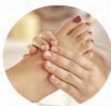
Deep Foot massage

Thanksgiving Christmas $5 Discount for any item