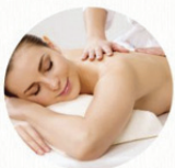
Deep Tissue massage