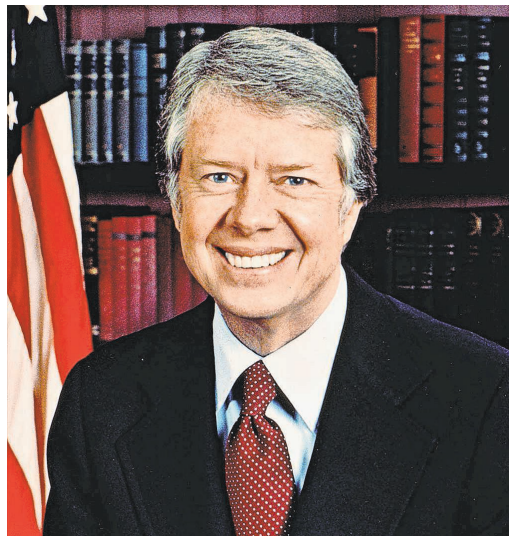
Former President James “Jimmy” Carter, the 39th president of the United States.

After leaving the White House, Carter devoted himself to humanitarian work, transforming the role of former presidents. Through The Carter Center, founded with Rosalynn in 1982, he worked to promote democracy, monitor elections, and combat diseases