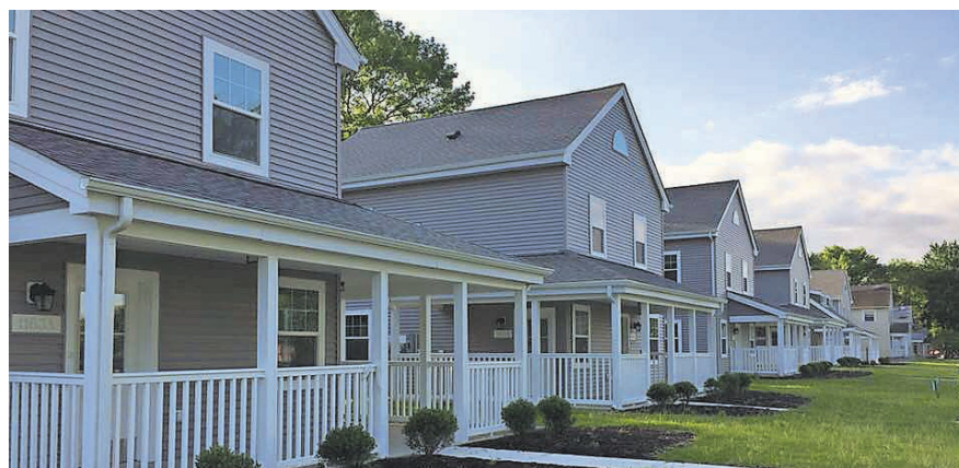
HELP Perry Point Veterans Village

When homeless veterans need help obtaining the aforementioned documents, upon being referred to the