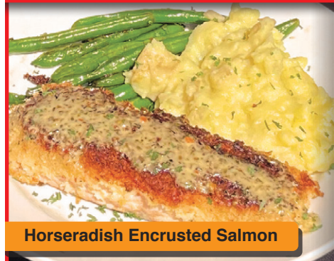
Horseradish Encrusted Salmon

Warm up with several new comfort food favorites.