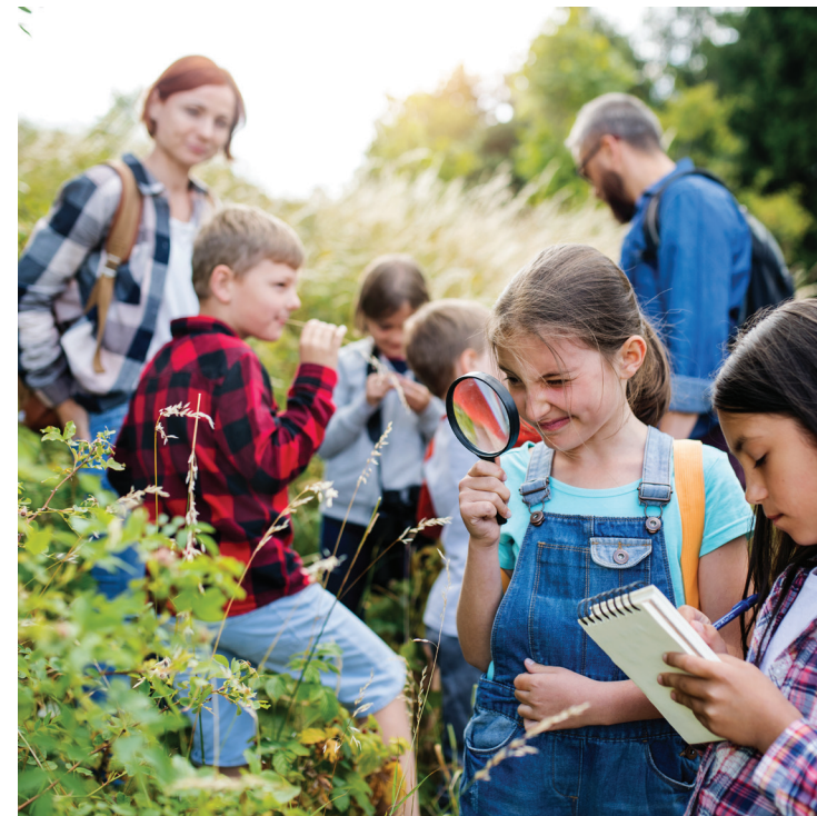
Summer camp provides children weeks of entertainment, camaraderie and opportunities to learn and grow.

Rest assured that families who are a little late to the game may be able to find summer camp accommodations. But they may have to make some concessions.