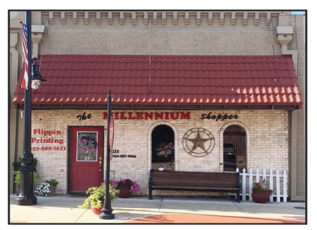
Flippin Printing located inside The Millennium Shopper at 115 Jefferson in Sulphur Springs.