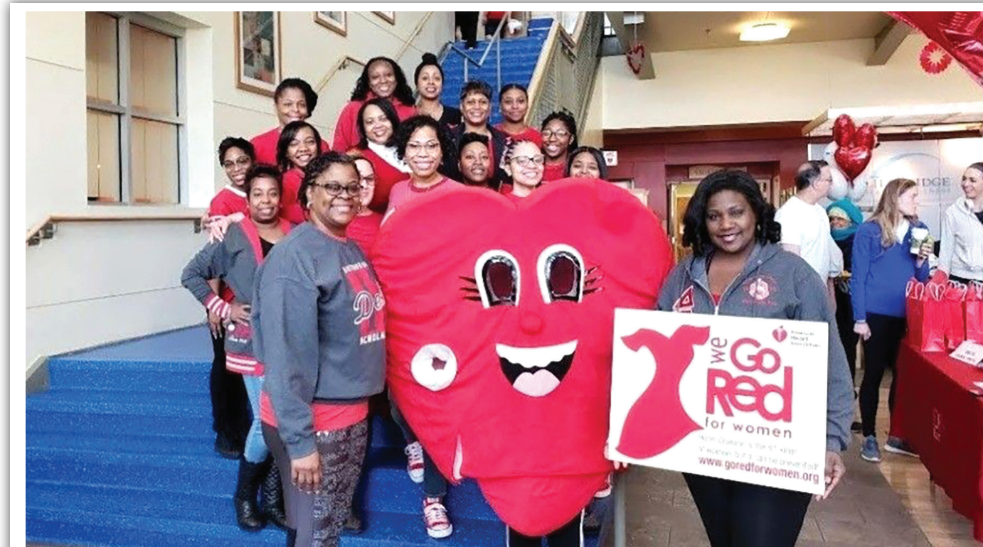
BCAC organizes and participates in the Heart Walk and Go Red for Women programs in collaboration with their charitable partner, the American Heart Association and LifeBridge Health and Fitness.

A study supported by the National Institutes of Health found significant race and sex-based disparities in the survival chances of individuals