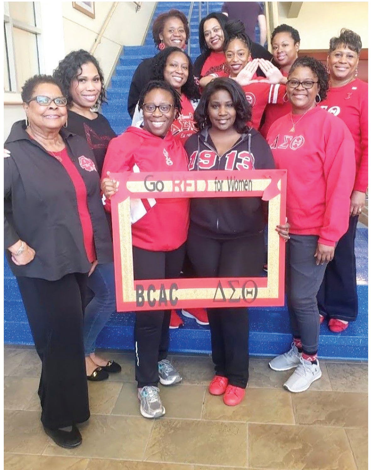
February is American Heart Month. Over the years the Baltimore County Alumnae Chapter (BCAC) of Delta Sigma Theta Sorority Inc. has been educating and empowering the community about the importance of heart health.