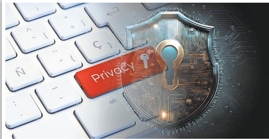
Make a commitment to be mindful of data privacy.

I spent that evening researching data privacy, reviewing my online habits, and uncovering just how much of my