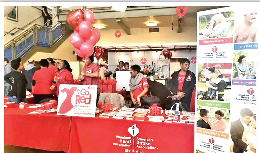
BCAC organizes and hosts a Go Red for Women event at LifeBridge Health and Fitness.