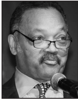
Jesse Jackson Sr.

Senator Bernie Sanders, the Democratic candidate for president, shocked people when he noted that 51 percent of African-Americans aged 17 through 20 who have graduated high school or dropped out of high school are unemployed.