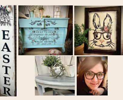
Mention this Ad and get 15% of your purchase of $25

Tailor your decor to fit your personal taste and space.