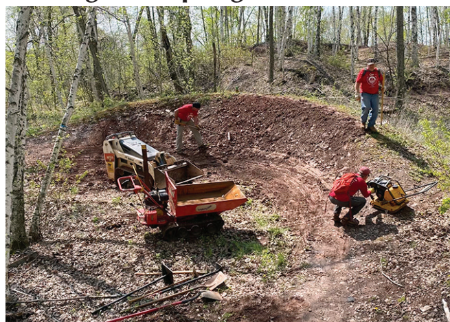
Mountain bike crew volunteers keeping trails maintained in the CCSRA.

By ANN SCHWARTZ Information from Chuck Carlson