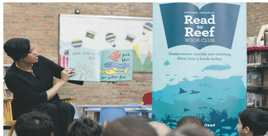
Mayor Stephanie Rawlings-Blake reads a book from the “Read to Reef” Book Club to students.

Baltimore— The National Aquarium, in partnership with the Enoch Pratt Free Library System and alongside Mayor Stephanie Rawlings-Blake, announced the launch of the Read to Reef Book Club. The Read to Reef Book Club offers free admission to the National Aquarium for any child up to fifth grade with a Pratt Library card who participates in the reading program.