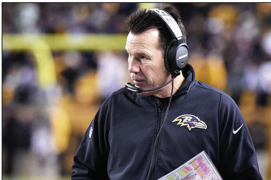
Former Baltimore Ravens offensive coordinator Gary Kubiak preparing to call a play during the 2014 season. Kubiak is now head coach of the Super Bowl Champions Denver Broncos.

Another move that proved to be wise was the addition of Justin Forsett. Forsett entered training camp with an