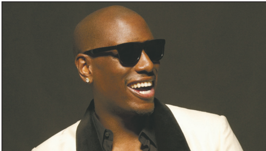
Six time Grammy-nominated R&B singer, author, philanthropist and internationally renowned film star Tyrese Gibson joins Coca-Cola to help inspire and empower teens to strive for their highest potential through the 2016 Coca-Cola "Pay It Forward" program.