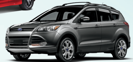
2016 Ford Escape