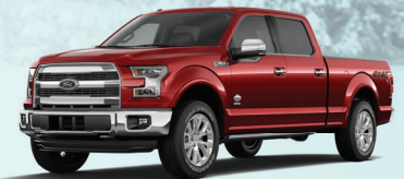
2015 Ford F-150

PLUS $1,000 HOLIDAY BONUS CASH 2 ON 2015 FOCUS / 2016 FUSION & ESCAPE