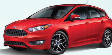
2015 Ford Focus