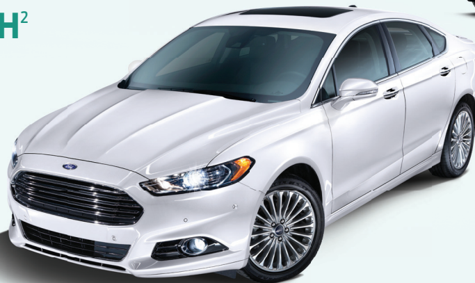
2016 Ford Fusion