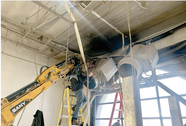
Workers assessed and repaired damage from the fire, which was contained thanks to a quick-thinking citizen who called 911 and the swift action of local first responders, after the fire started due to a heater issue.

ZIPS Car Wash is giving back to the Baxter community on Saturday, March 8, with a special Free Wash Day, inviting residents to enjoy a complimentary car wash from 8 a.m. to 12 p.m. at both of their local locations. This generous event comes as a heartfelt thank-you to the community for their support in the aftermath of a fire that caused significant damage to ZIPS' Universal Drive location in December 2024.