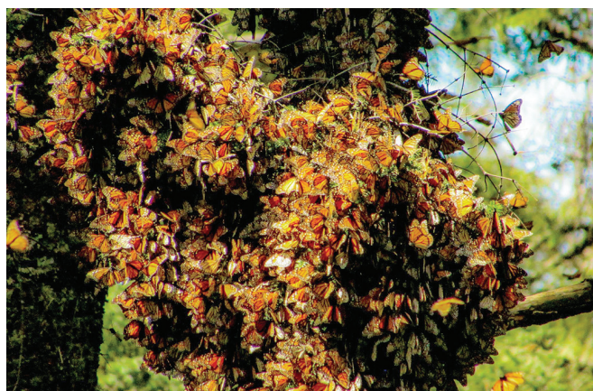
Thousands of monarch butterflies roost together in Mexico making fluttery golden wreaths.

You can also learn more about monarch butterflies by taking online classes through monarchjointventure.org .