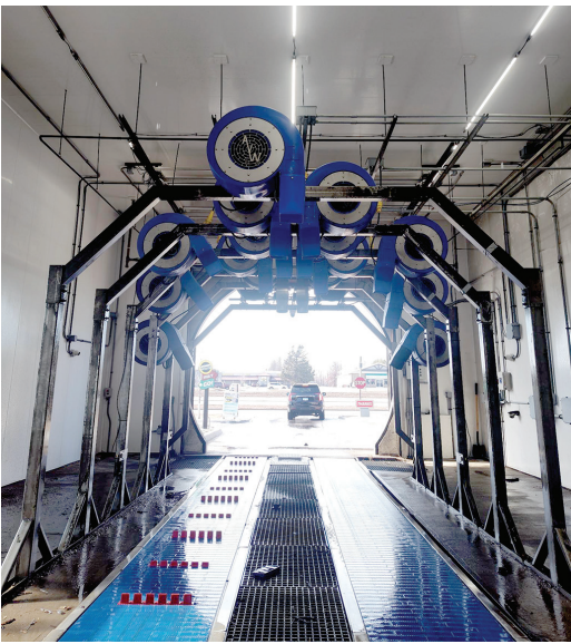
After lots of hard work from local vendors, the tunnel exit, where the fire occurred, is fully repaired, including a new exit door. ZIPS Car Wash is ready for you to enjoy a free car wash on Saturday, March 8 at either of its Baxter locations.

ZIPS Car Wash, headquartered in Plano, Texas, operates over 260 locations across 23 states under the ZIPS Car Wash, Rocket Express Car Wash, and Jet Brite Car Wash brands. With two decades of experience in the car wash industry, ZIPS is known for delivering the highest-quality express tunnel car washes, combining advanced technology with exceptional customer service. ZIPS also provides