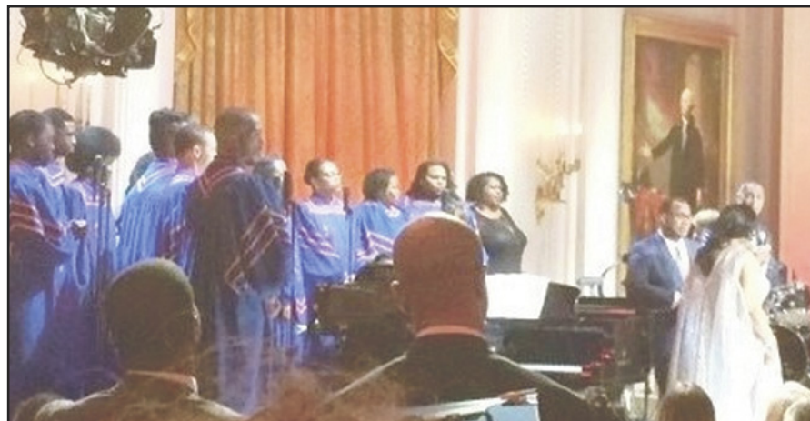
Morgan State University Choir launches Black History Month at the Reginald F. Lewis Museum by performing traditional African American spirituals and gospel selections on Saturday, February 6, 2016 at 3 p.m.