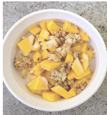
Mango and Papaya Afterhcop

For more information about African Heritage & Health Week or for African recipes, visit: www.oldwayspt.org/ .