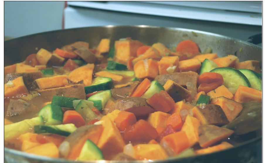
Mafe: Sweet Potato Peanut Stew