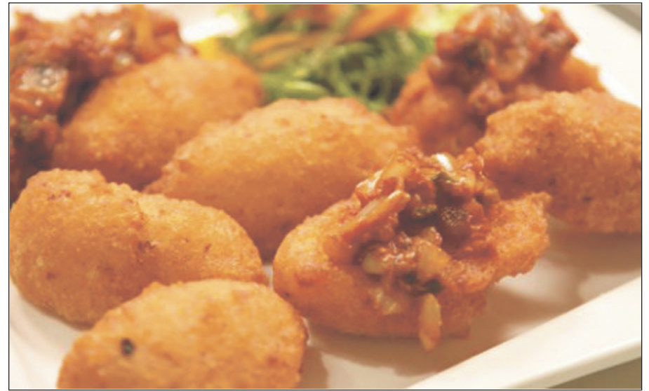
Accara: Black-eyed Pea Fritters from West Africa