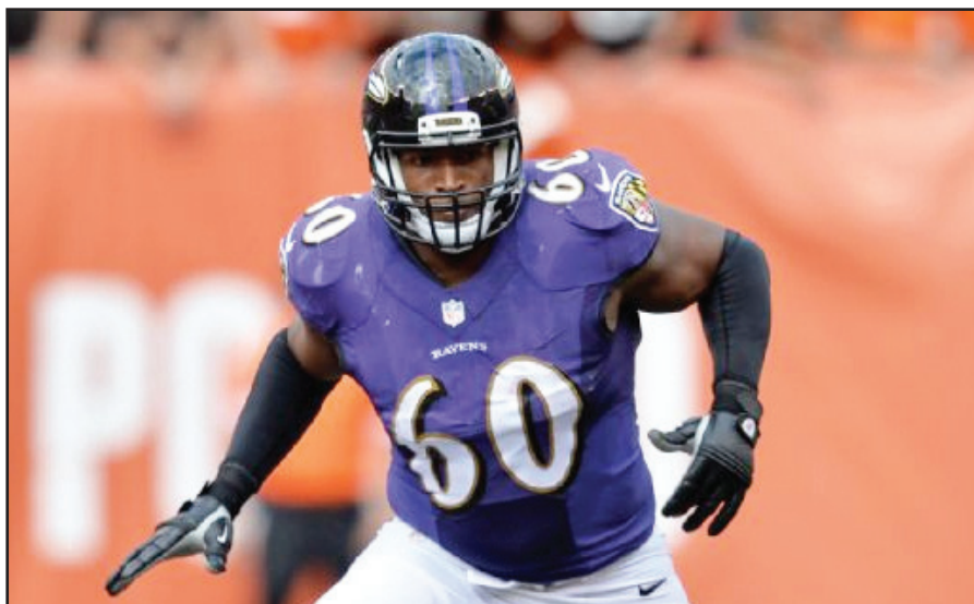
Baltimore Ravens left tackle Eugene Monroe in pass protection during a game against the Denver Broncos on September 13, 2015 at Sports Authority Field in Denver, Colorado.

General Manager Ozzie Newsome addressed what went on behind the move