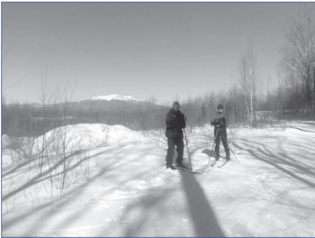
Wonderful views of Mount Katahdin can be observed from the Hammond Ridge Trails

In recent years, several friends have recommended Nordic skiing on the Hammond Ridge Trails (HRT) near Baxter State Park. About a three hour drive from my home in Topsham, arranging a trip to ski the trail system is logistically difficult. A major mid-February storm that dropped 16 inches of snow on the area motivated me to plan two days of skiing in the vicinity.