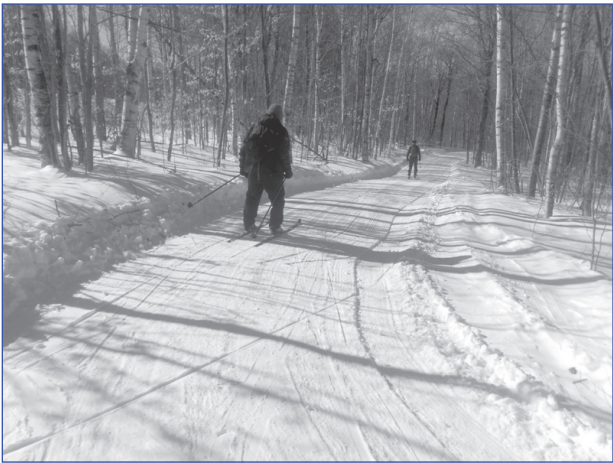
Twin Pines Loop offered a freshly groomed surface

The 1.7 mile Lakeside Trail travels northeast and then loops back along Millinocket Lake. It appeared to have been groomed and tracked the previous day. Unfortunately, high winds had blown an abundance of small spruce branches and needles onto the trail slowing progress and requiring careful maneuvering. Despite the obstacles, we glided along on gentle grades back to Twin