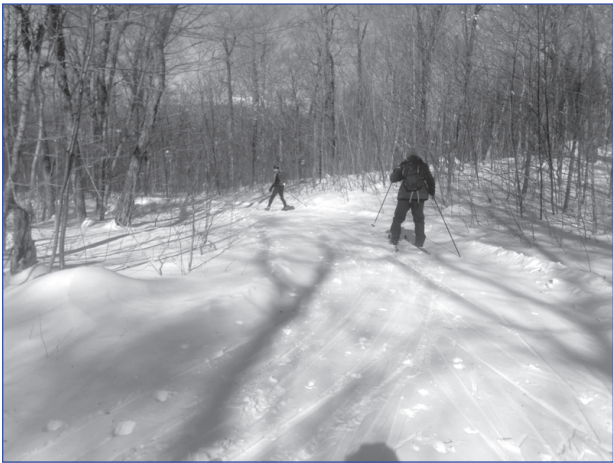
Skiers descend a hard-packed surface on Katahdin View Trail

north out of Millinocket on Millinocket Lake Road for 8 miles and then followed Blackcat Road for a short distance to NEOC. After checking in, making trail donations and obtaining trail maps, we motored to a higher elevation trailhead next to River Drivers Restaurant.