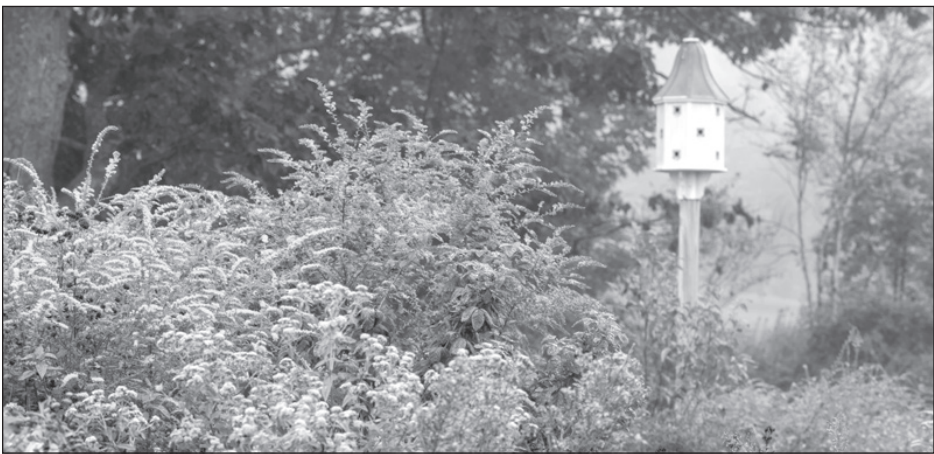
Resilient perennials support wildlife and pollinators while adding beauty to your garden.