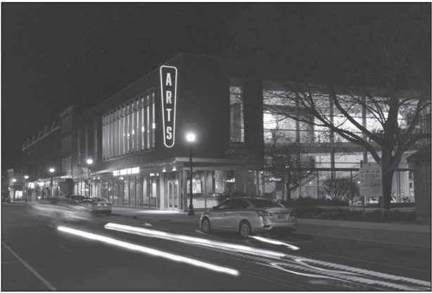
The Paul J. Schupf Art Center, in the heart of Waterville’s downtown arts district, will host a record number of art teachers for this year’s MAEA spring conference.