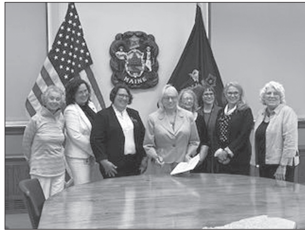
The passage of LD1046 by the Maine Legislature and signed into law by Governor Mills in 2021 established this Maine income tax check-off box option, becoming only the second state in America to establish that convenient, effective way to spread your support/contribution throughout your home state.

You have the option of contributing $5 or $10 or $25 by checking one of those boxes, or more