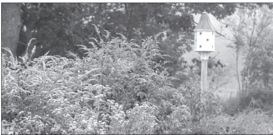
Resilient perennials support wildlife and pollinators while adding beauty to your garden.

Registration is required; sliding scale fee options are available. Register on the event webpage to attend live or receive the recording link. For more