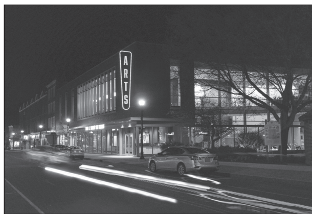
The Paul J. Schupf Art Center, in the heart of Waterville’s downtown arts district, will host a record number of art teachers for this year’s MAEA spring conference.