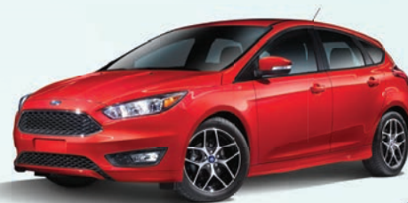
2015 Ford Focus

$1,000 HOLIDAY BONUS CASH 2 PLUS ON 2015 FOCUS / 2016 FUSION & ESCAPE