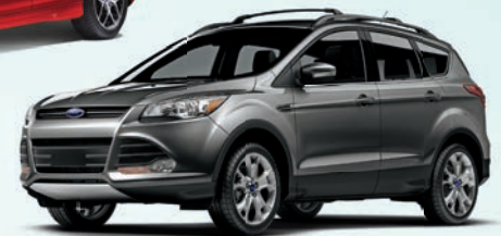
2016 Ford Escape