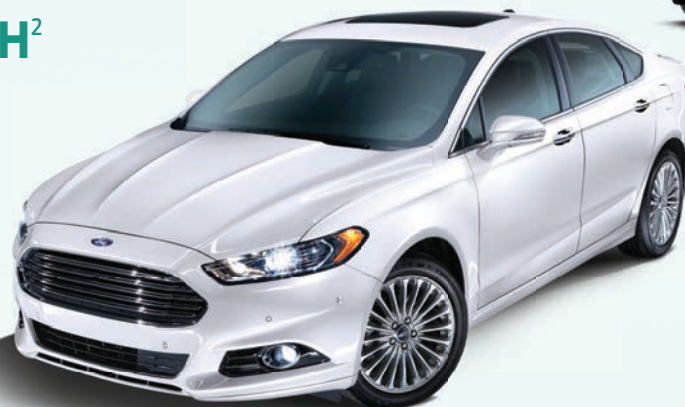
2016 Ford Fusion