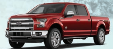
2015 Ford F-150