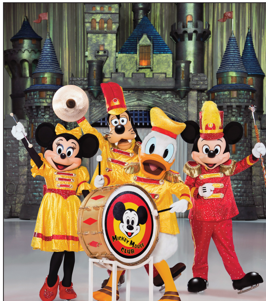
“Disney Mickey,” Mickey's Marching Band