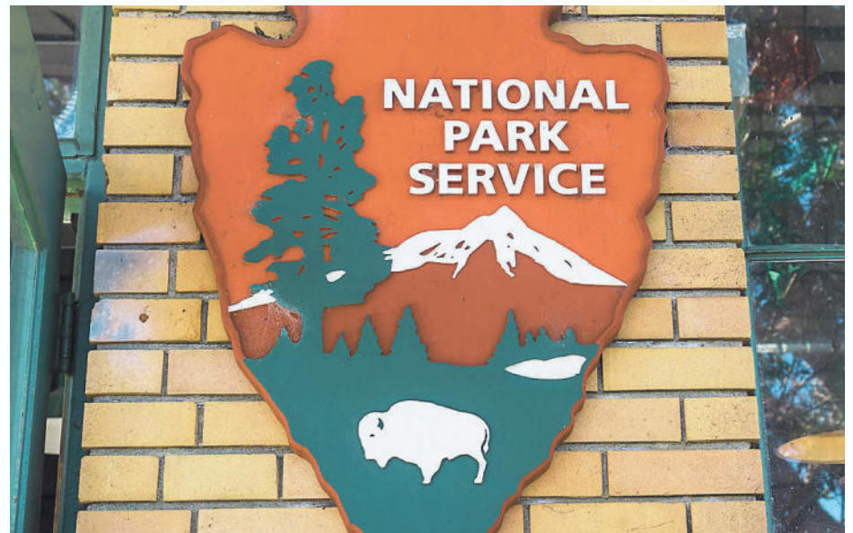
August 26, 2017 Richmond/CA/USA - United States National Park Service (NPS) emblem. NPS is an agency of the United States federal government.