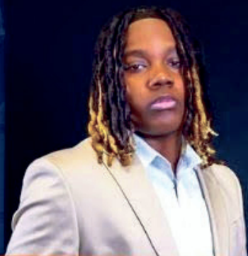
JACKPOT JIGGA (W. CHICAGO)

Top 3 $20,000 in products, services & cash!