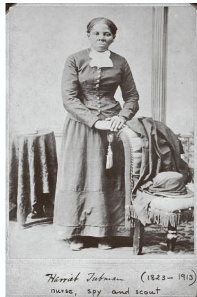
Harriet Tubman