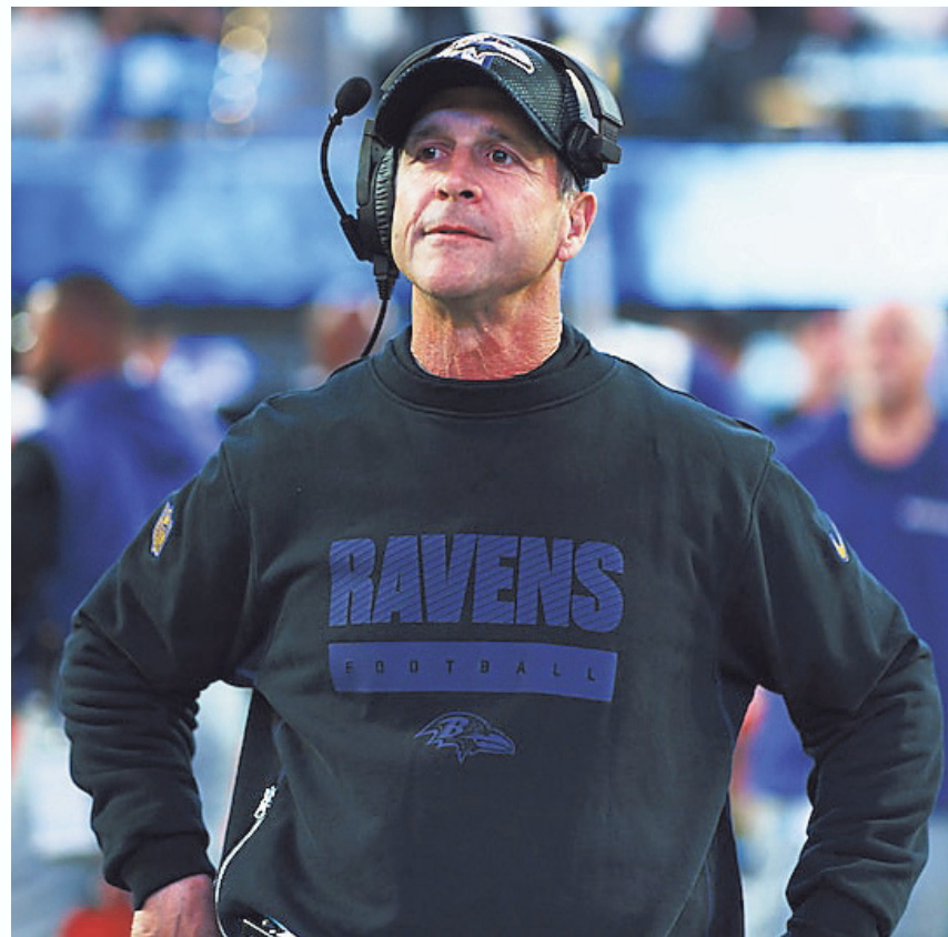
John Harbaugh

Harbaugh is one of five coaches in NFL history to lead his team to the postseason at least 12 times over his first 17 seasons as a head coach. He