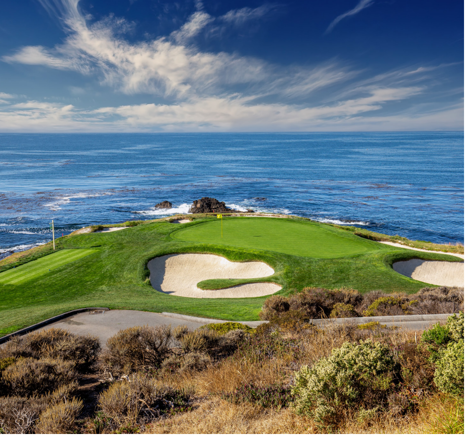
A view of Pebble Beach golf course, Hole 7, Monterey, California