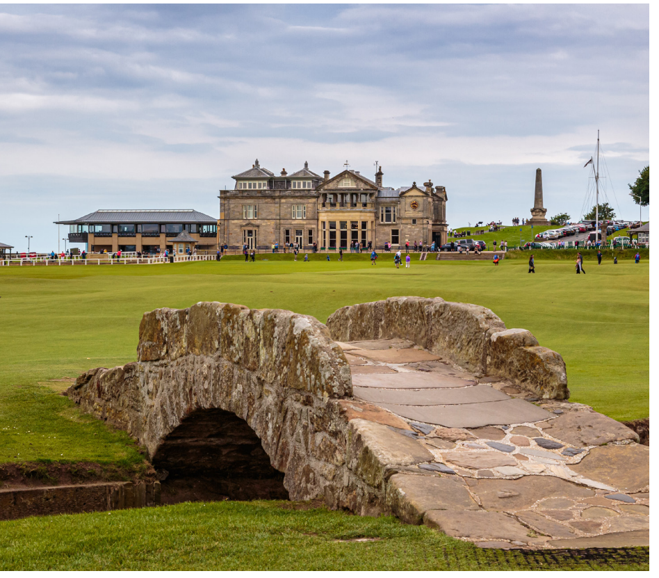
A small stone bridge in St Andrews Links golf course, Scotland. The bridge spans the Swilcan Burn between the first and eighteenth fairways on the Old Course