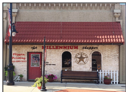
Flippin Printing located inside The Millennium Shopper at 115 Jefferson in Sulphur Springs.