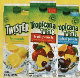
ORANGEADE, LEMONADE, OR TROPICANA PUNCH 59 Oz. CNTR.