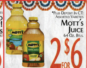
*PLUS DEPOSIT IN CT: ASSORTED VARIETIES MOTT'S JUICE 64 Oz. BTL.