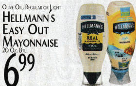
OLIVE OIL, REGULAR OR LIGHT HELLMANN'S EASY OUT MAYONNAISE 20 Oz. BTL.