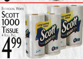
BATHROOM, WHITE SCOTT 1000 TISSUE 4 ROLL PKG.