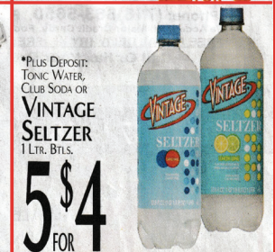
*PLUS DEPOSIT: TONIC WATER, CLUB SODA OR VINTAGE SELTZER 1 LTR. BTL.