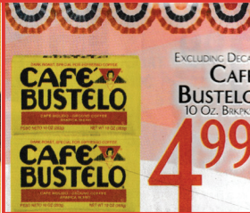
EXCLUDING DECAF CAFE BUSTELO 10 Oz. BRPKS.