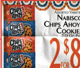
ASSORTED VARIETIES NABISCO CHIPS AHOY! COOKIES 7.3 Oz. PKG.