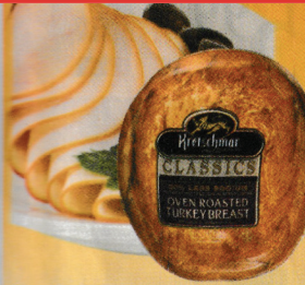
OFF THE BONE OR LOWER SODIUM KRETSCHMAR OVEN ROASTED TURKEY BREAST