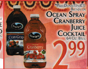
*PLUS DEPOSIT IN CT: BLENDS OR OCEAN SPRAY CRANBERRY JUICE COCKTAIL 64 Oz. BTL.