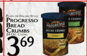
PLAIN OR ITALIAN STYLE PROGRESSO BREAD CRUMBS 24 Oz. CNSTR.