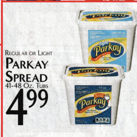
REGULAR OR LIGHT PARKAY SPREAD 41-48 Oz. TUBS