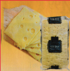
GREAT LAKES SWISS CHEESE

FREE LOCAL DELIVERY 'TIL 5:00PM CURBSIDE DELIVERY CALL OR FAX YOUR ORDER FOR PICK CREDIT CARDS ACCEPTED WE ACCEPT EBT, FOOD STAMPS & WIC