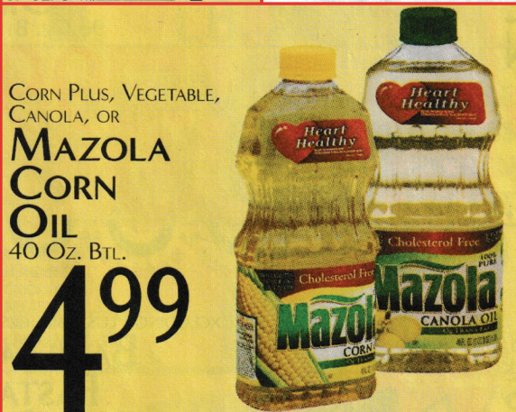
CORN PLUS, VEGETABLE, CANOLA, OR MAZOLA CORN OIL 40 Oz. BTL.