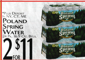
*PLUS DEPOSIT IN NY, CT, ME POLAND SPRING WATER 24 Oz. 16.5 Oz. BTL.