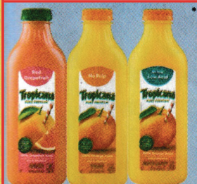
*PLUS DEPOSIT IN CT: RUBY RED GRAPEFRUIT, BLENDS, LIGHT OR