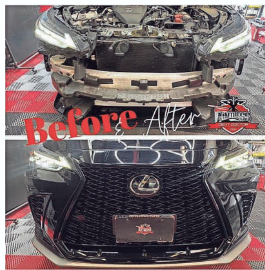
Front-end replacement on a Lexus SUV.