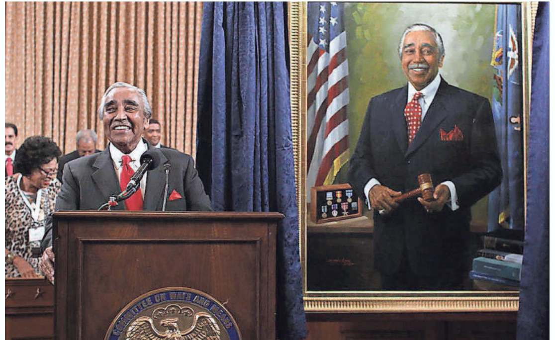
Congressman Charlie Rangel

Rangel was the first African American to serve as Chairman of the powerful House Ways and Means Committee. As chair and as a member of the Committee, Rangel played a central role in shaping U.S. tax legislation. He advocated for progressive tax reform, closing corporate loopholes, and increasing tax equity. Rangel was also a strong supporter of Social Security and Medicare and defended and expanded programs aimed at reducing poverty and supporting working-class families.