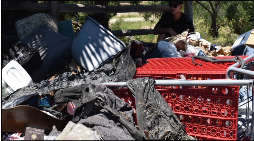
San Jose wants to strengthen its policy on abandoned shopping carts. The nonprofit, The Trash Punx, fishes out shopping carts from the Guadalupe River. File photo.