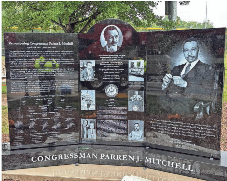
The City of Annapolis, in partnership with the Caucus of African American Leaders and the Martin Luther King Jr. Committee, Inc. of Annapolis & Anne Arundel County, unveil and dedicate the Parren J. Mitchell Memorial, to honor the first Black Congressman elected from the state of Maryland at Roger "Pip" Moyer Recreation Center on Wednesday May 28, 2025.