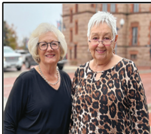
See Joy or Pat!

We can print yard signs, banners, window signs for your office, political signs, etc. If you can imagine it...we can print it!