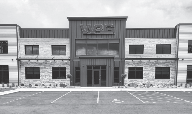
The new office building on the Deerwood Shortcut houses workers from a multi-million dollar firm with corporate headquarters in Deerwood.

By ANN SCHWARTZ Water Resources Group (WRG), the parent company of Rice Lake Construction, has completed a new 10,000-square-foot