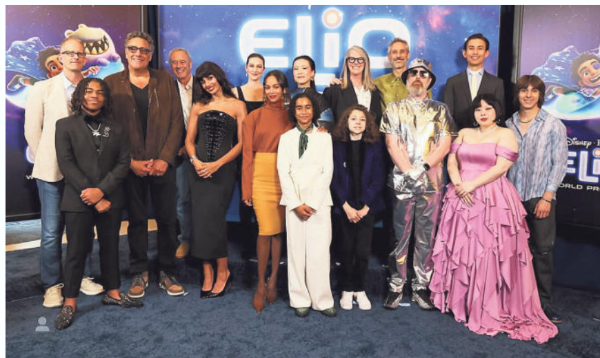
The World Premiere of "Elio" was held on June 10, 2025 in Los Angeles, California.