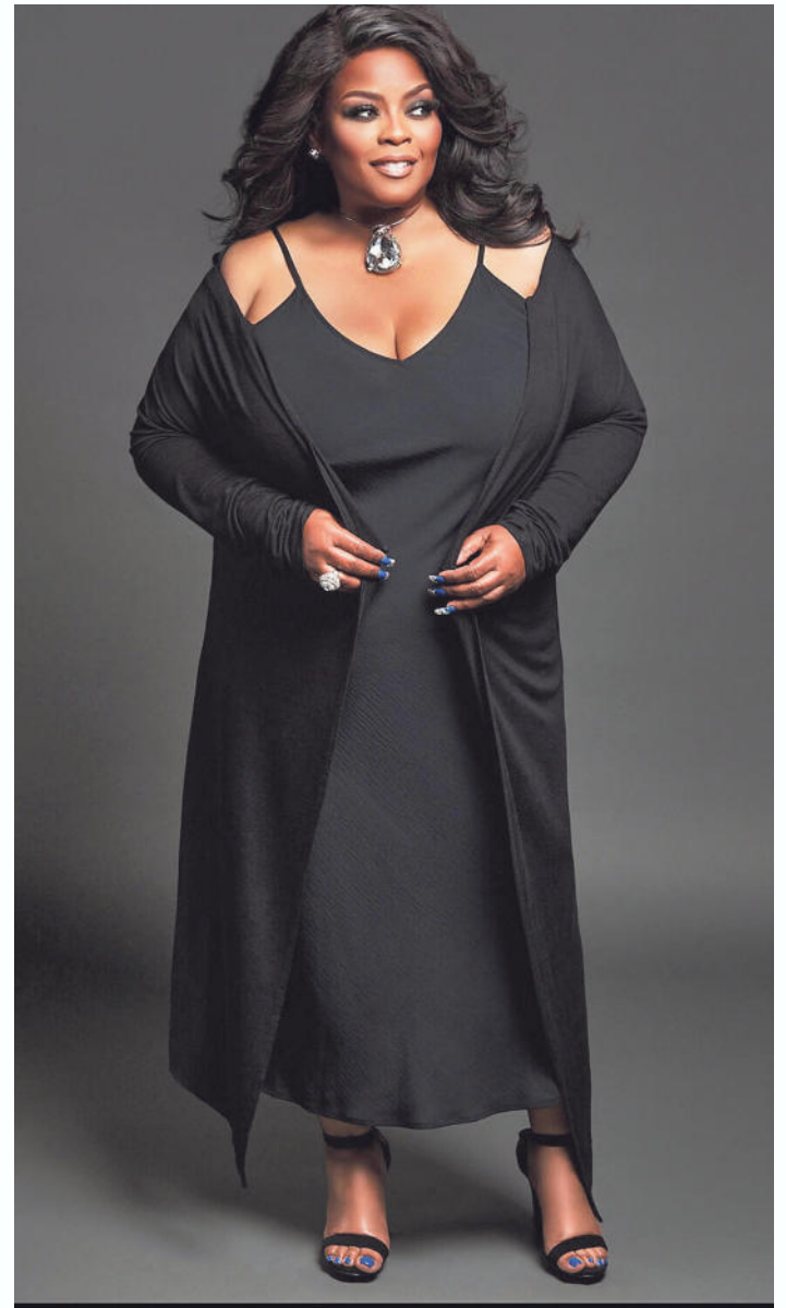
Maysa Leak, Grammy-nominated singer and Morgan State University alumna.

Fans can catch Maysa on a six-city tour this summer, including a two-week cruise engagement. But no matter the venue, her gratitude never fades. "Every time someone spends their money to come hear me sing, I don't take that for granted," she said. "It's a gift every single time." Asked what message she hopes people take from Black Music Appreciation Month; Maysa was direct: "Hold on to it. Don't let anybody erase it," she stated. "You can't change history. We brought a lot to this whole world musically. We have to preserve it and hand it down to our children and grandchildren."