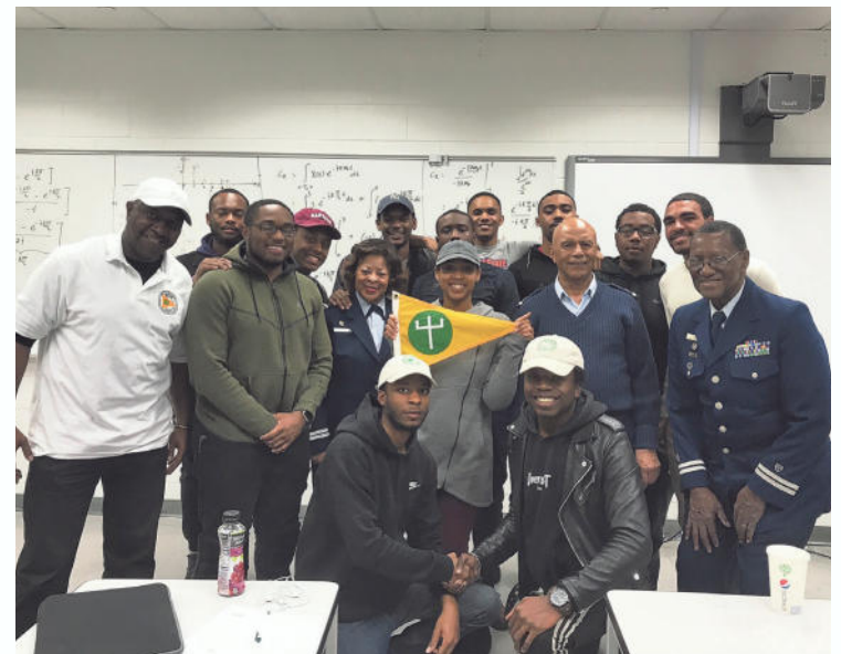
Neptune Yacht Club partnered with the United States Coast Guard Auxiliary to train and certify students at Morgan State University in 2018.